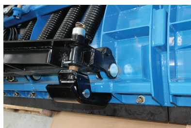
Optional skid shoe