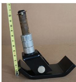
Skid shoe size