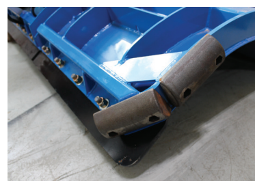
Optional curb guards