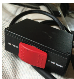
Electric Switch Box