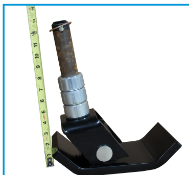
Optional skid shoes