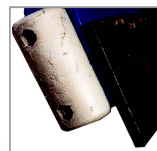
Optional curb guards