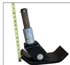
Optional skid shoe