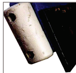
Optional curb guards