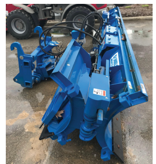
Optional hydraulic wing swing available