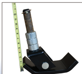
Optional skid shoe